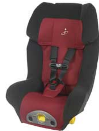
IMMI Safe Guard