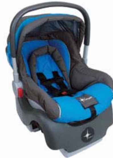
Compass I-400 LP