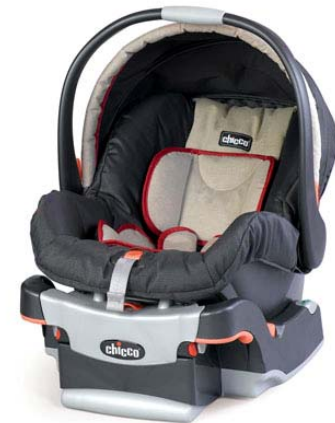
Chicco - KeyFit Infant