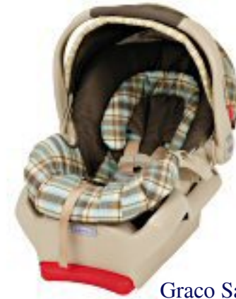
Graco Safe Seat – Step 1