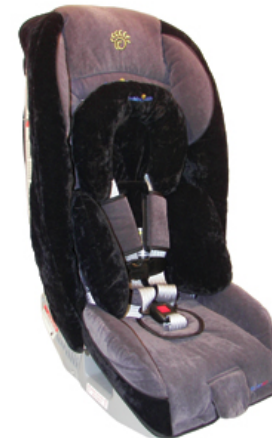
Sunshine Kids Radian 80