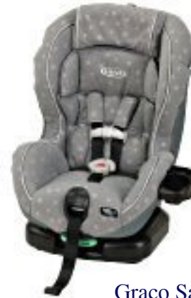
Graco Safe Seat – Step 2